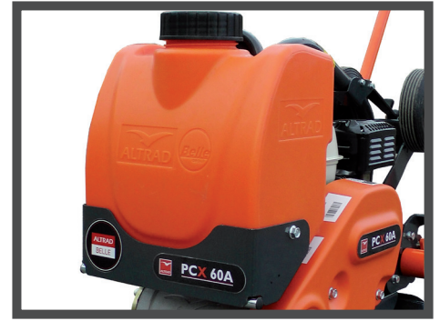
OPTIONAL 'EASY-FIT' 12LTR WATER TANK