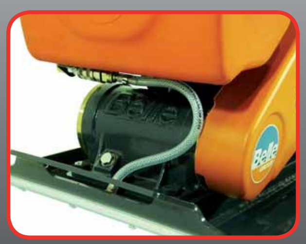
Large Watertank And Spray Bar