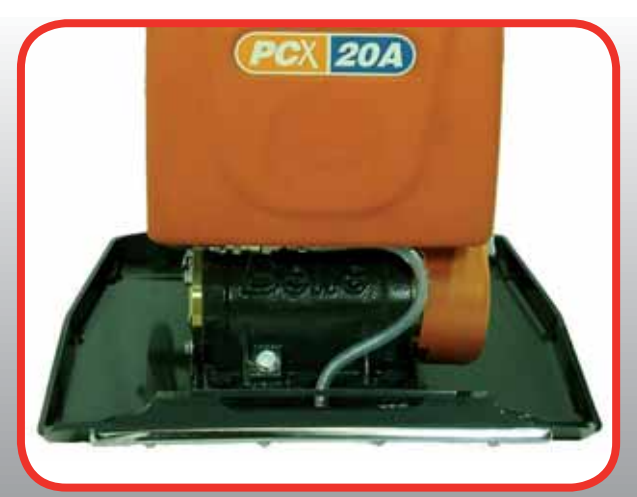
Tapered Baseplate To Avoid Track Marks