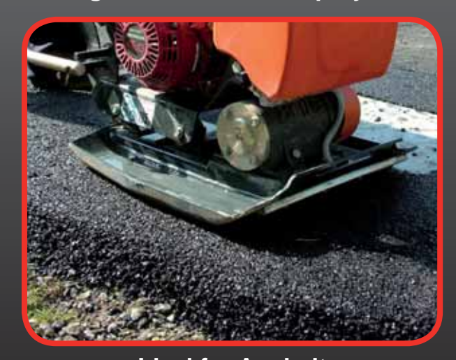
Ideal for Asphalt